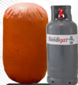
LPG & BIOGAS (FOR COOKING)