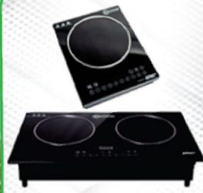
ECOOK INDUCTION STOVES