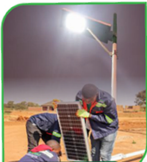
SOLAR STREET LIGHTS